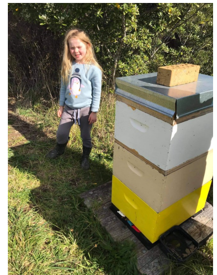
Learning about Bees